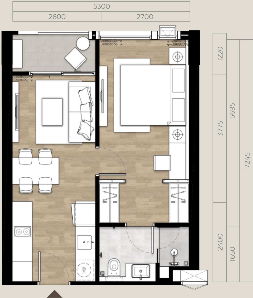
1 BEDROOM TYPE A 42 SQ.M.